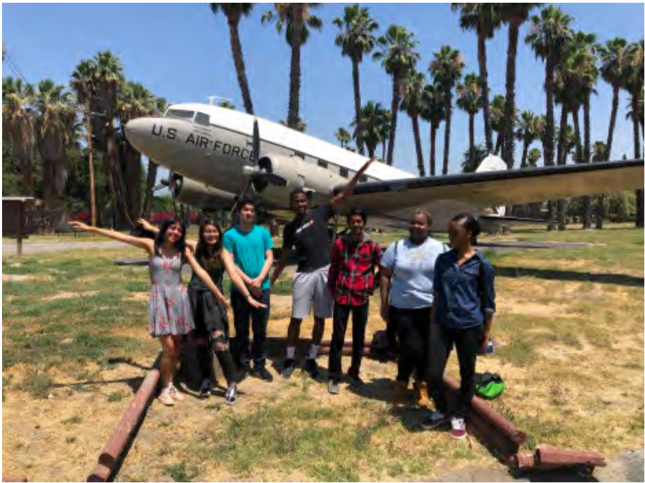
South Bay students fly airplanes as part of their program in the National Summer Transportation Institute after learning about the transportation industry. Program concluded with graduation dinner Monday, July 15, 2019.